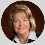
NEW YORK STATE SENATOR Betty Little