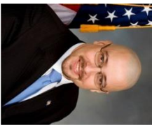
State Senator Gustavo Rivera