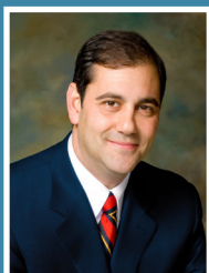
Senator Andrew Lanza