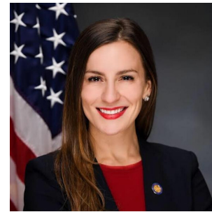
STATE SENATOR Alessandra Biaggi