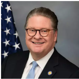
STATE SENATOR Peter Harckham

Hosted by the Westchester State Senate Delegation