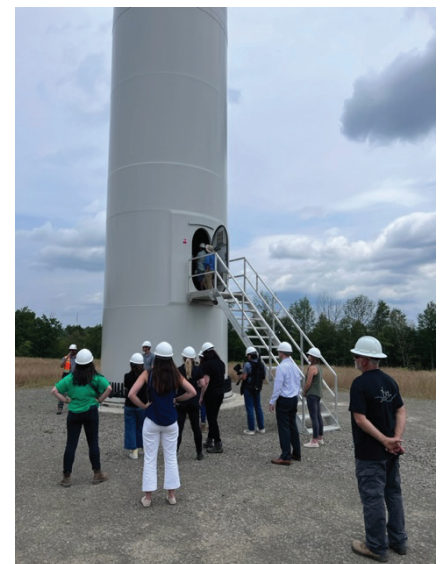
A tour of Bluestone Wind.

As we approach our clean-energy targets, we can anticipate forging a brighter future that consists of more economic development in our rural communities.