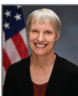
Senator Rachel May Senate Chair (48th)

The NYS Legislative Commission on Rural Resources is a joint bipartisan commission of the State Legislature with a mission to promote the viability of rural communities.