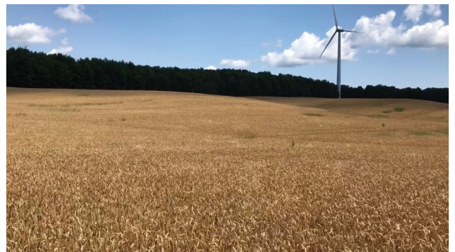
Wheat field in Central New York.

If you’re interested in learning more on this topic, you can visit https://cals.cornell.edu/field-crops/small-grains and https://www.newyorksoilhealth.org/resources/cover-crops/ .