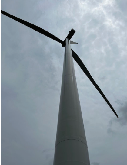
A wind turbine at Bluestone Wind.

Article Courtesy of Jeff Jones, Communications Consultant with ACE NY