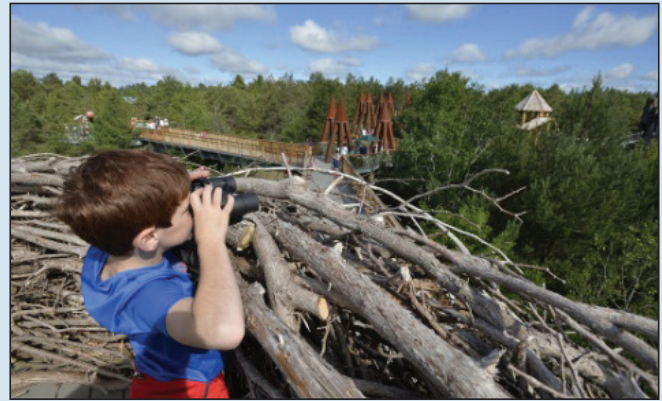
A view from the nest.

Among its features is a large version of an eagle’s nest where visitors take in the view from the highest point of the walk. There is also a giant spider’s web, allowing guests to traverse a web of cargo netting suspended more than two stories above the ground.