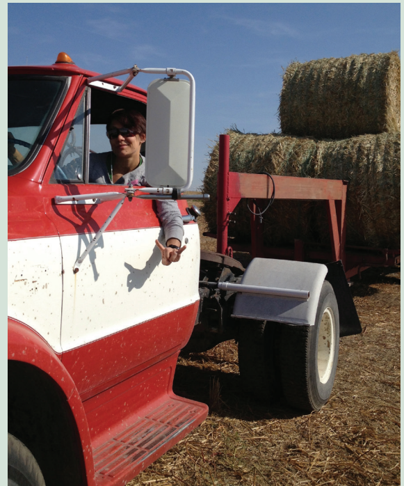
Olympian Katie Uhlaender hard at work on her beef cattle farm in Kansas.

He also bought a farm east of Denver and convinced Ms. Uhlaender to invest in her future by purchasing her own cattle to be raised on the family farm.