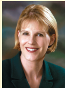
Senator Catharine M. Young, Chair

The NYS Legislative Commission on Rural Resources is a joint bipartisan office of the State Legislature.