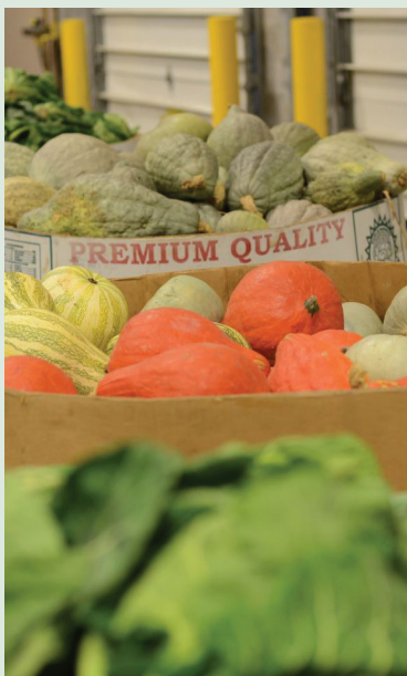
Donations of produce at a food bank.