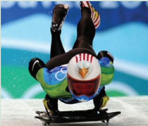
Ms. Katie Uhlaender begins a run down the track.