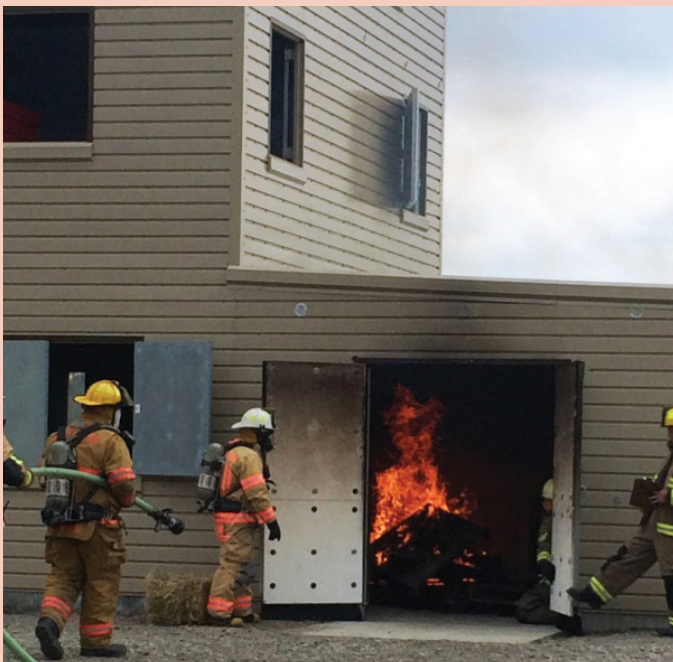
The St. Lawrence County Fire Training Facility, Inc., in St. Lawrence County, received a $14,000 Community Facilities Grant to install electrical work in their training facility. The facility is critical for volunteer firefighters as they conduct mandatory training.

The United States Department of Agriculture (USDA) is seeking applications for loans and grants through USDA Rural Development’s Community Facilities program. This program finances essential community facilities in rural areas and towns of up to 20,000 in population. These facilities include childcare centers, hospitals, medical clinics, assisted living facilities, fire and rescue stations, police stations, community centers, public buildings, and transportation systems. Given their importance, USDA strives to ensure that facilities like these are available to all rural residents. Funds are available to public bodies, non-profit organizations, and tribal governments. Applications are accepted on an ongoing basis.