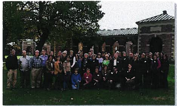
Friends groups like those at this Saratoga/Capital Region Friends Gathering contribute significantly to the stewardship of the state parks system.

Often, these groups are comprised of a relatively small number of dedicated individuals—in most cases, volunteers—who accomplish herculean tasks: they raise private funds for capital projects; perform maintenance tasks; provide educational programming; and promote public use through hosting special events.