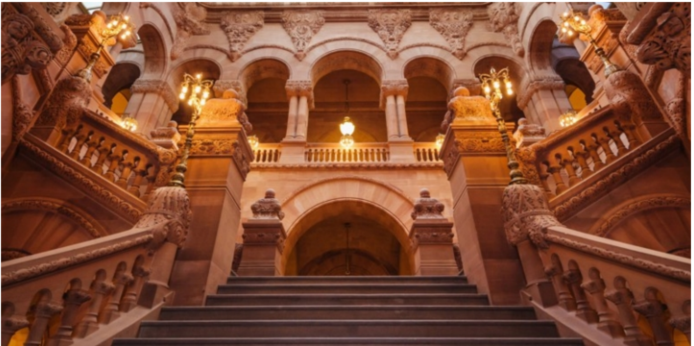
New York State Capitol Building

The movers and shakers in the state Capitol.