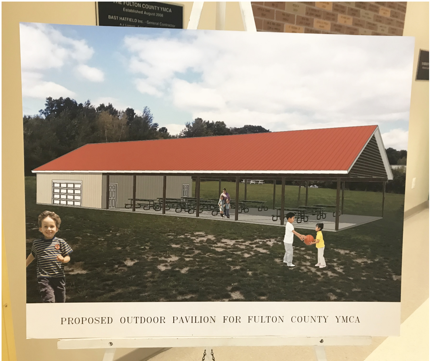
PROPOSED OUTDOOR PAVILION FOR FULTON COUNTY YMCA

pavilion for the Y's summer camp, ceramic tile for the pool and locker room, a new storage shed, replace the front steps and add new lighting and install security cameras at the facility to improve safety for all. I look forward to coming back later this year for the ribbon cutting once this project is complete," said Tedisco.