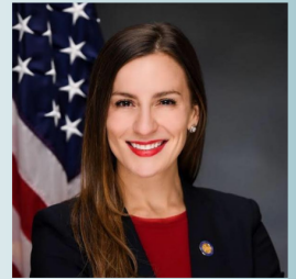
STATE SENATOR Alessandra Biaggi

Please join community members, advocates and other interested parties for a virtual community budget forum regarding the proposed 2021-22 NYS Budget. We welcome anyone's opinion as written or oral testimony. Each speaker will have up to two (2) minutes to speak. If you or someone you know would like to submit testimony ahead of or after the event, it can be submitted to WestchesterDelegationnysenate.gov . To watch the events live, visit Facebook.com/Andrea.StewartCousins (A Facebook account is not required to watch).