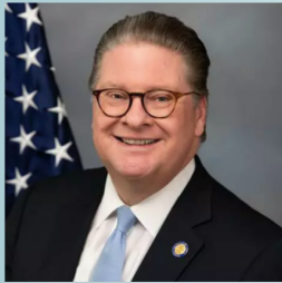
STATE SENATOR Pete Harckham

The events will be streamed live on Facebook: Facebook.com/Andrea.StewartCousins (A Facebook account is not required to watch.)