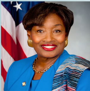
MAJORITY LEADER Andrea Stewart-Cousins