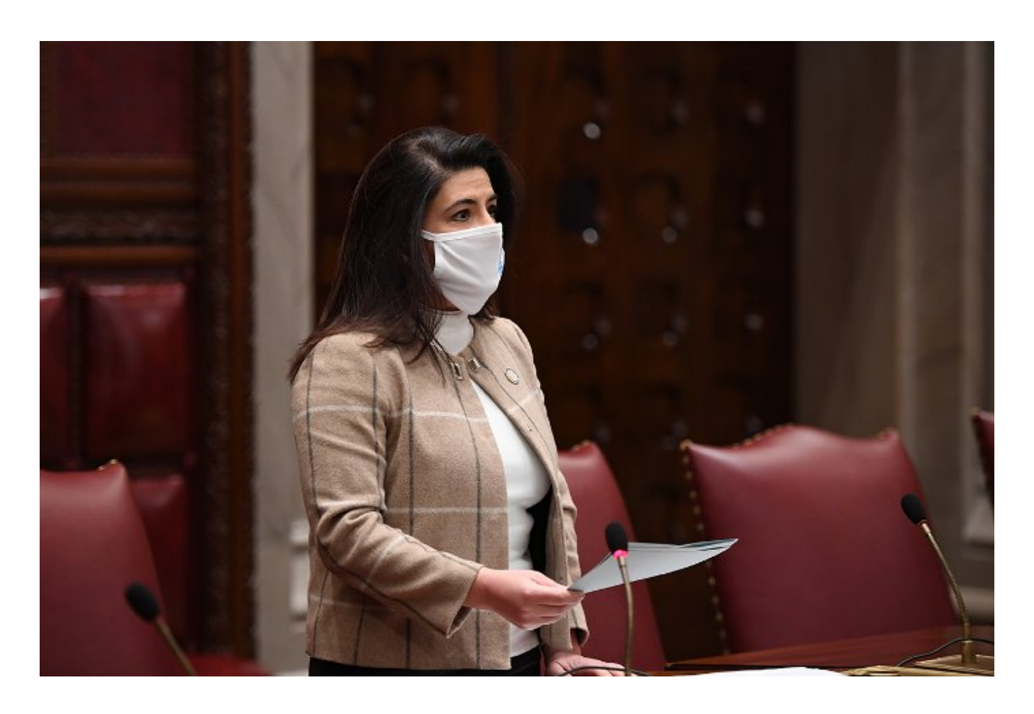
Click here to download HD Video and full-res photos of Senator Kaplan speaking on the bill from the Senate Chamber. ALSO: Click here to download video of exchanges between Senator Kaplan and real estate professionals on the topic of implicit bias during hearings on housing discrimination

CARLE PLACE, NY (December 21, 2021) - Today, Governor Kathy Hochul signed a package of legislation combating housing discrimination across Long Island and New York State, including legislation by Senator Anna M. Kaplan (D-North Hills) requiring real estate brokers and salespersons to undergo training on implicit bias as part of their license renewal process. The legislation was crafted following the publication of Newsday's "Long Island Divided" investigation, and public hearings on housing discrimination held by the State Senate, which found evidence of widespread discrimination against minority homebuyers on Long Island.