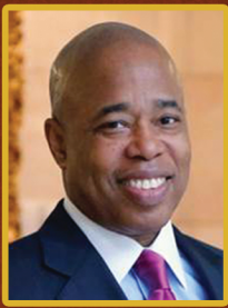
BROOKLYN BOROUGH PRESIDENT ERIC L. ADAMS