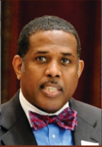
NYS SENATOR KEVIN PARKER