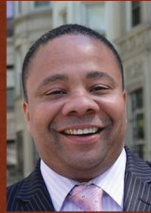
NYS SENATOR JESSE HAMILTON