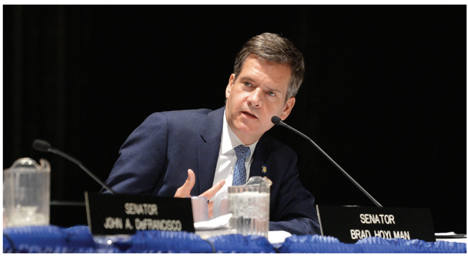
"Where are the polluters?" I asked at the Senate water quality hearing in Hoosick Falls

As Ranking Member of the Senate's Environmental Conservation Committee, I am extremely concerned with reports of contaminated water in communities across the state, in particular dangerous levels of perfluorooctanoic acid (PFOA), a known carcinogen, in local water supplies in Hoosick Falls, Petersburg and Newburgh. After months of growing public pressure, including my calls for legislative hearings, the Senate convened three hearings in September on this issue. Unfortunately, representatives from the companies responsible for pollution failed to attend and submit to questioning by the Legislature. I've demanded Senate Republicans use the legislative subpoena power to compel the appearance of these three companies to testify under oath. I will continue to pressure the Senate to take stronger action to manage this unprecedented water contamination crisis.