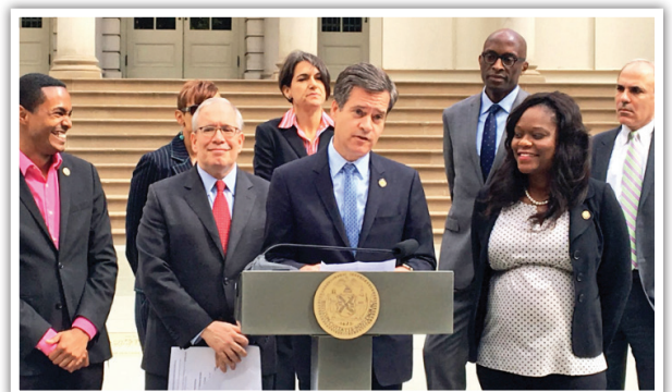
Advocating for greater diversity in city contracting with NYC Comptroller Scott Stringer

In September, I partnered with New York City Comptroller Scott Stringer to announce my legislation along with Assembly Member Rodneyse Bichotte to add safeguards in state law against discrimination on the basis of race, religion, sexual orientation, age, disability, and other protected classes in government contracting and procurement. No one should be denied a seat at the table because of who they are when it comes to doing business with New York State's government.