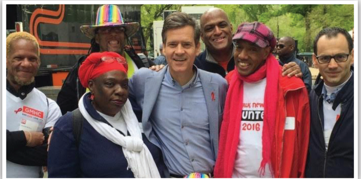
Joining HIV/AIDS advocates at this year's GMHC AIDS Walk New York

On December 1, I was honored to help formally dedicate the new NYC AIDS Memorial Park at St. Vincent's Triangle on World AIDS Day to help honor the more than 100,000 New Yorkers who have died from HIV/AIDS. I was proud to support this project from its inception as the Chair of Community Board 2 where I served on the jury for the memorial's design. As State Senator, I secured $500,000 of State and Municipal Facility Program funding to complete the memorial's construction and will continue to make funding for HIV/AIDS a priority in the 2017 NYS Budget and fight for legislation extending housing benefits to low income New Yorkers with HIV/AIDS.