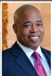
ERIC L. ADAMS