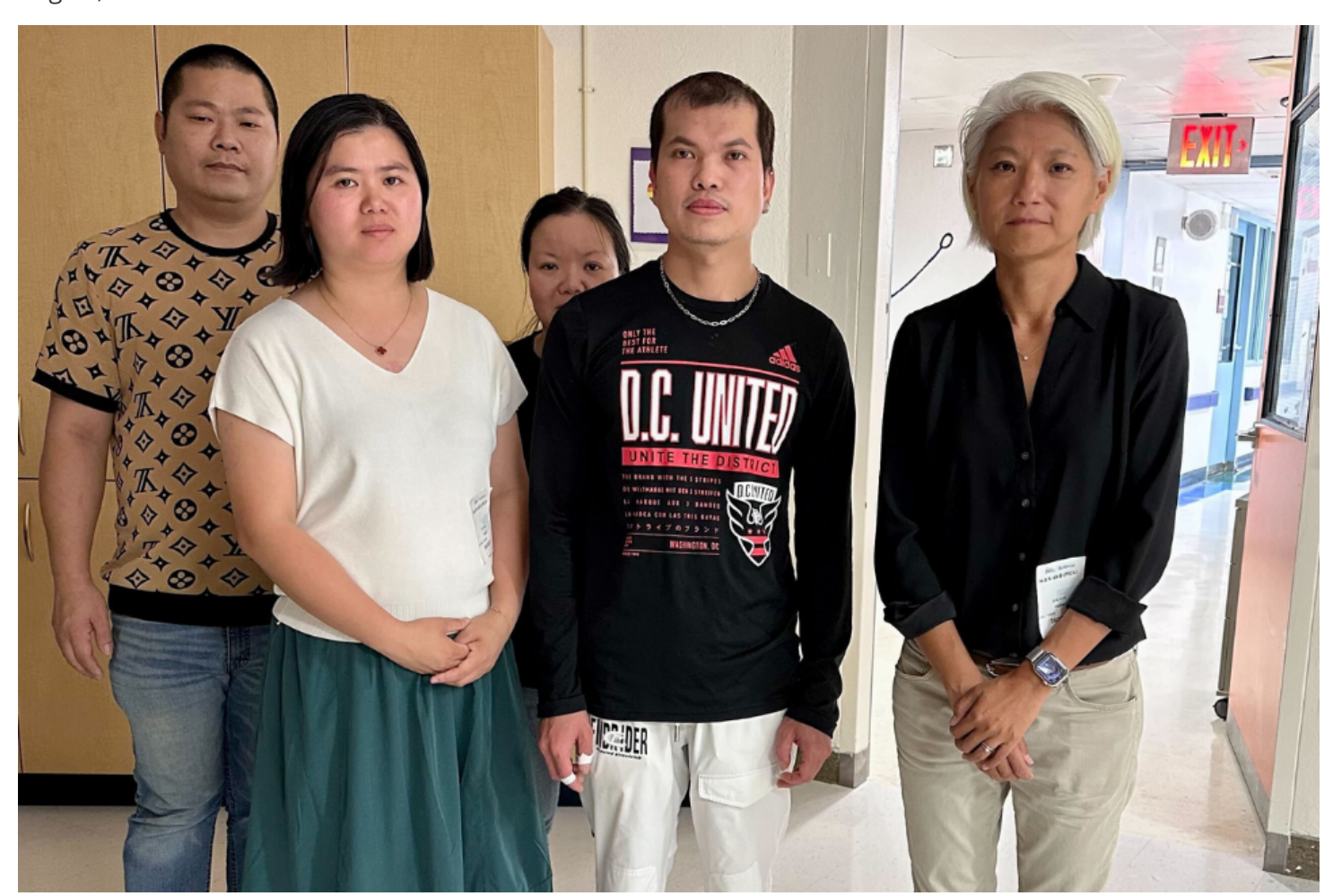
State Sen. Iwen Chu and the family members of the children.