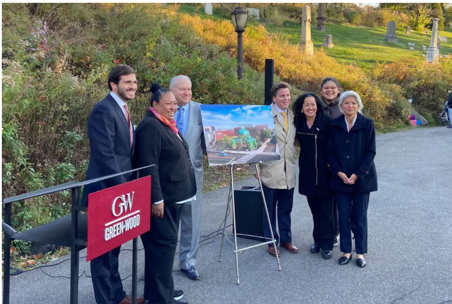
The Green-Wood Cemetery received $500,000 in state funding for its Education and Welcome Center