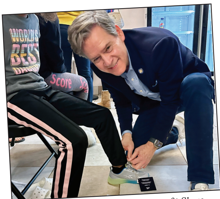
My team joined forces with the nonprofit Shoes That Fit to distribute footwear and socks to asylum seekers on the Upper West Side.

■ $10 million to fund lawyers representing tenants in eviction proceedings.