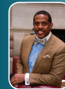
SENATOR KEVIN S. PARKER 21 ST SENATE DISTRICT

Web: parker.nysenate.gov Email: parker@nysenate.gov