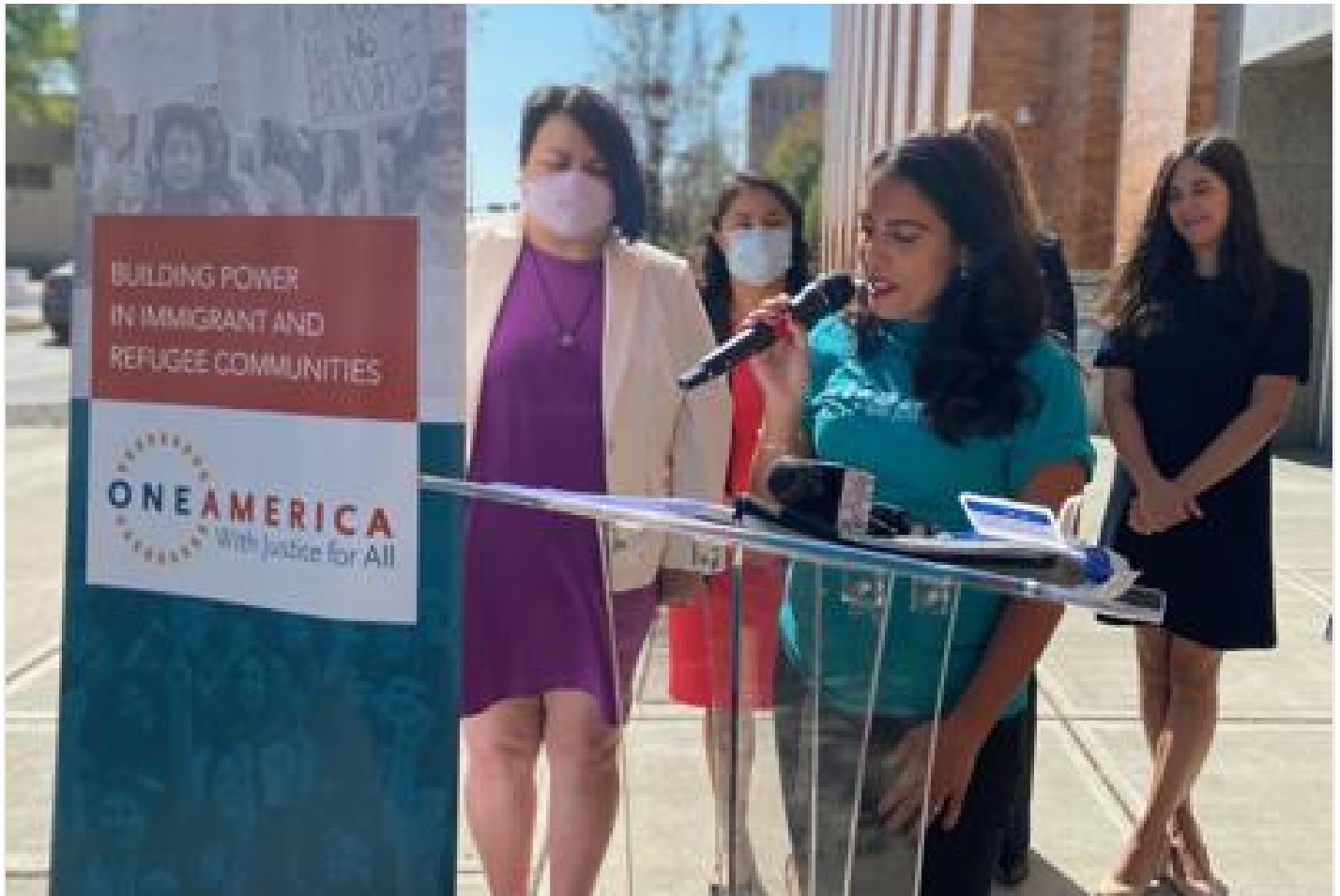
Yakima County ordered to pay nearly $272,000 in voting rights case, lower than $2M requested