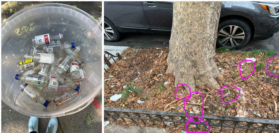
Nips containers collected from the ground in a Brooklyn neighborhood.

Including more containers for deposit. The Bigger Better Bottle Bill would place a deposit on most non-carbonated beverages, including tea, sports drinks, wine, liquor, and nips bottles. Nips are very small liquor bottles which are a new major source of litter. Dairy product containers are excluded. Including more types of containers in the deposit program is a critical upgrade that would divert more containers that could be reused or recycled from landfills and incinerators. This measure would also reduce litter; people don't litter if they can claim a deposit, or if a container winds up in the environment, someone will collect it for the deposit