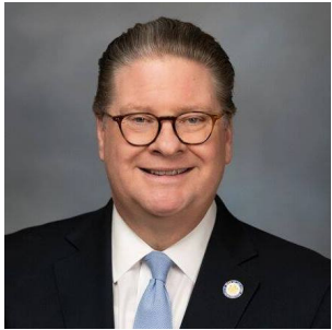
STATE SENATOR Peter Harckham

Hosted by the Westchester State Senate Delegation