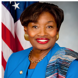
MAJORITY LEADER Andrea Stewart-Cousins