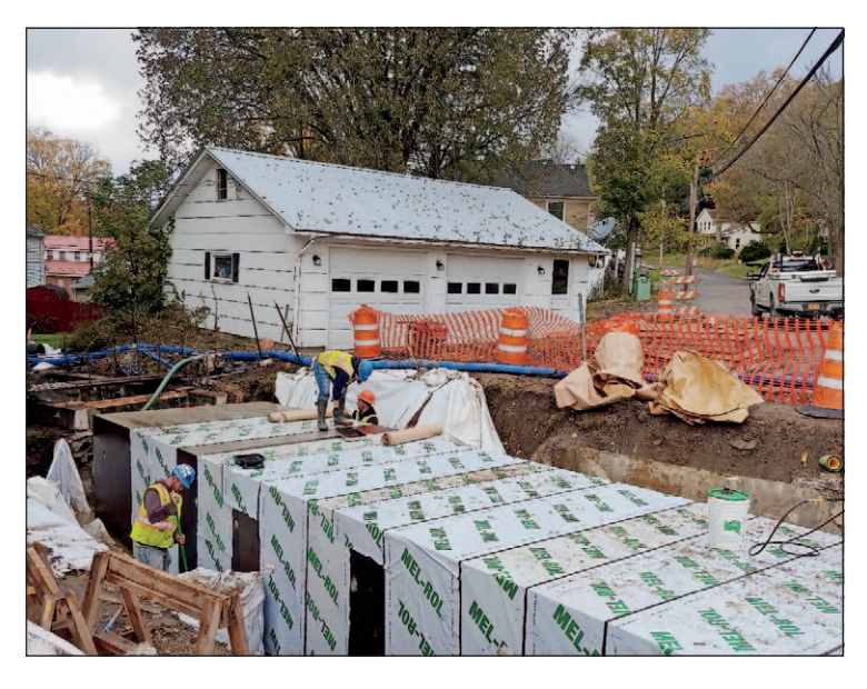
LC Whitford crews work on the Madison Creek box culvert project in the Village of Wellsville Tuesday.

f facebook.com/hornelleveningtribune • facebook.com/WellsvilleDailyReporter