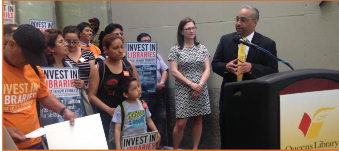
The Senator took part in a rally to support the call for an increase in public library funding. The Invest in Libraries rallies were a success, as City funding was increased by about $40 million.