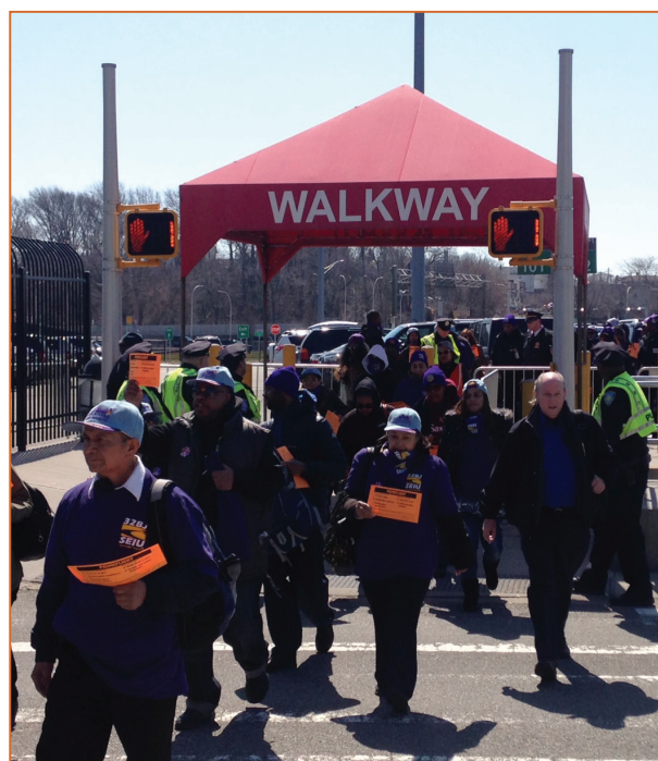
Senator Peralta joined workers at LaGuardia Airport urging companies that contract with airlines to put an end to low wages and unfair labor practices.