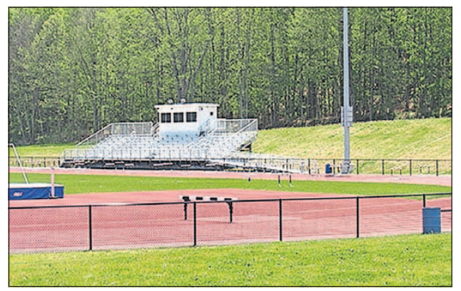
Tuscarora Elementary's new track was constructed as part of phase two of a massive project to renovate the Addison School District's facilities.