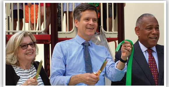
I joined kids and advocates at the ribbon-cutting for the newly-renovated Ramon Aponte Park in Hell's Kitchen on June 29