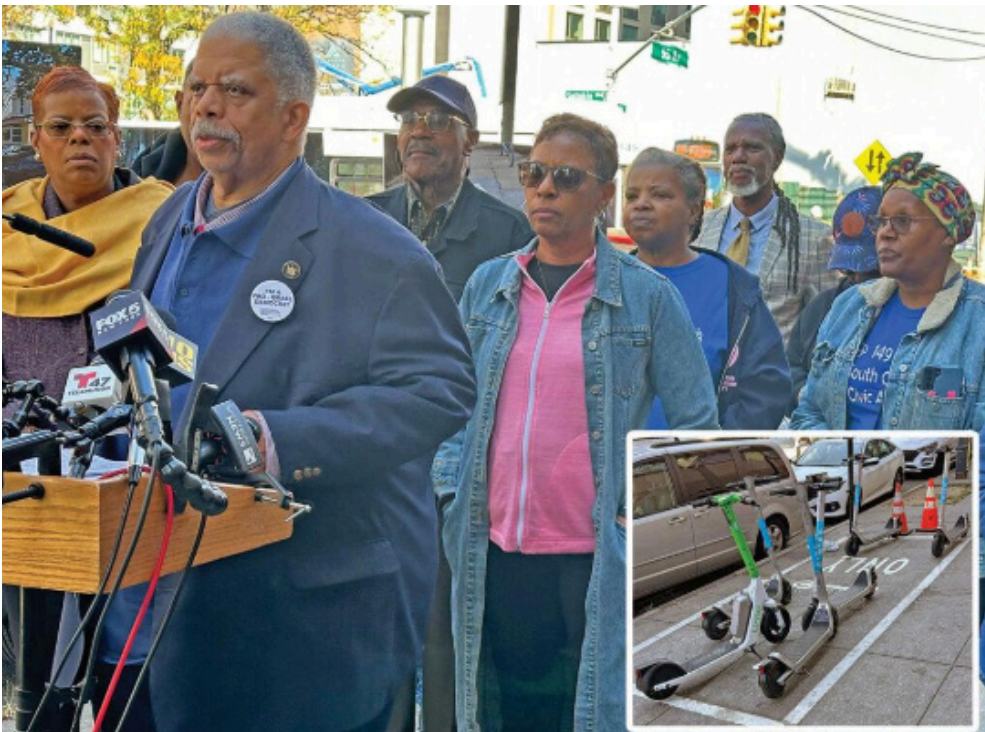
Senator Comrie and Speaker Adams at a press conference for the NYCDOT E-Scooter Program.