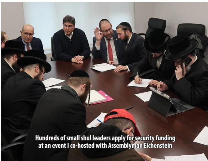
Hundreds of small shul leaders apply for security funding at an event I co-hosted with Assemblyman Eichenstein