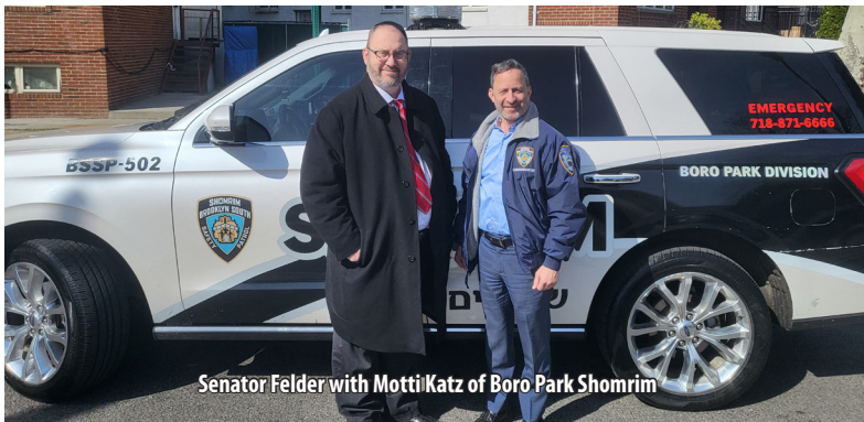
Senator Felder with Motti Katz of Boro Park Shomrim

In close collaboration with the NYPD, Boro Park Shomrim and Flatbush Shomrim are the gold standard of community policing and provide an invaluable service securing our neighborhoods.