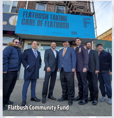
Flatbush Community Fund