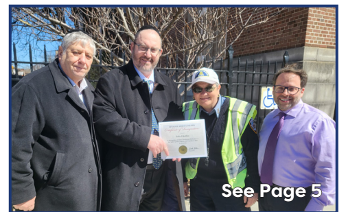
See Page 5