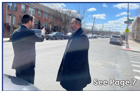
See Page 7