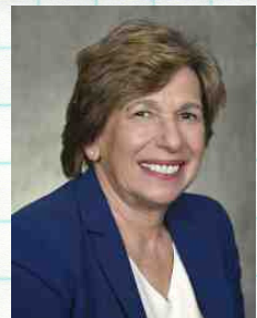
Randi Weingarten President, American Federation of Teachers, AFL-CIO