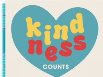
I'm thankful for my friends because they keep me entertained and they make me laugh