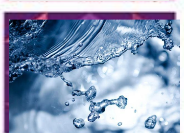
I'm thankful for water because it keeps me clean and hydrated.