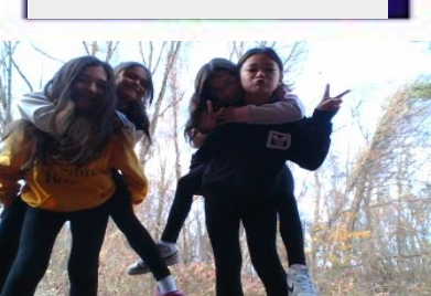
I'm thankful for music because it expresses my emotions.