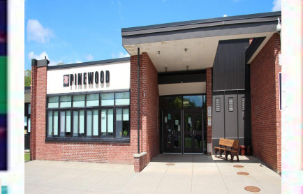
I'm thankful for school because we get to make friends and learn new thing.