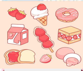
I'm thankful for the food we eat because without food i would be staving.